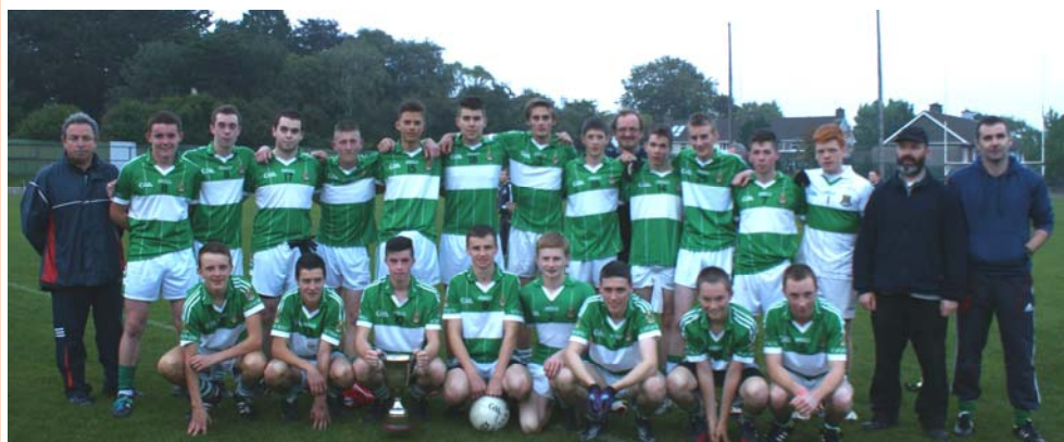
Aghabullogue Minor Footballers who captured the Rebel Óg East Minor B Football Championship by defeating Carrig Na bhFear on a score line of 2.14 to 1.06.