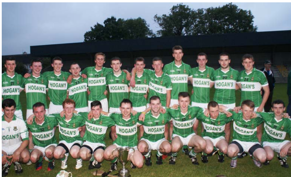
The Aghabullogue under 21 hurlers who defeated Blarney to win the Mid Cork title

Hard luck to the aghabullogue minor hurlers who played a superb game of hurling but came up short in the final few minutes of their Premier 2 final against Carbery. .the score line will show the Aghabullogue boys were defeated by 10 points but for those lucky enough to be in Pairc Ui Rinn witnessed a team who played their hearts out and were very unlucky to be beaten at all. the final score,4.17 to 1.16. Disappointment for the boys but they can be extremely proud of the way they played. Aghabullogue Abú.